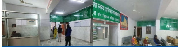
Photos of Organisation