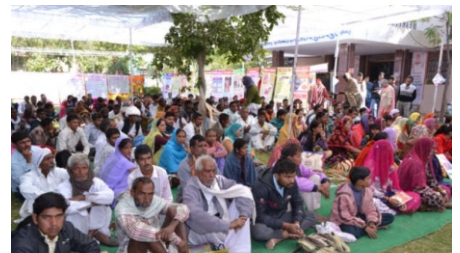
Patients at Camps